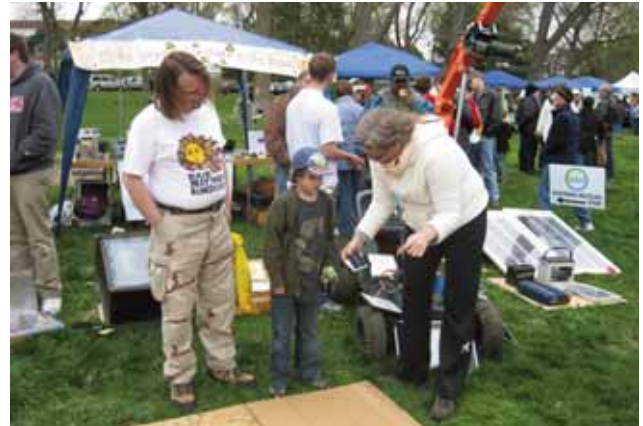
Above: Learning about clean energy from the Nebraska Solar Energy Society.

12:00 PM: Capoeira Angola 1:00 PM: Yoga Rocks the Park 2:00 PM: The Omaha International Folk Dancers 3:00 PM: Young Spirit - Native American Youth Dance Group