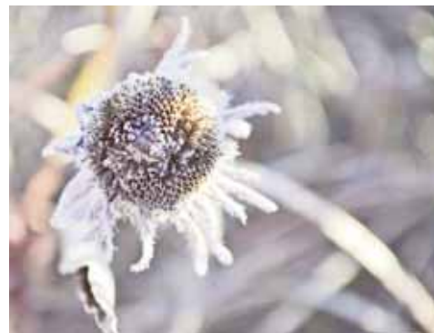
"Fractal -001" by Alicia Armentrout

614 S. 11th St. 402-345-1576 www.bluebarn.org Standing on Ceremony: The Gay Marriage Plays—January 8-10 and 15-17 Two little words and suddenly your whole world changes. Unique takes on the moments before, during and after "I do."