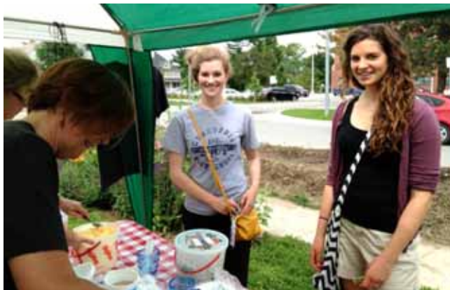
Photos from the garden include neighbors enjoying ice cream and picking strawberries.