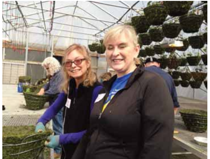
Photos from the planting last year.